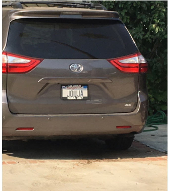
MOST BEAUTIFUL LADY